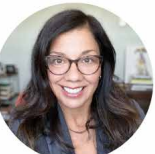
Nati Litz Capital Group